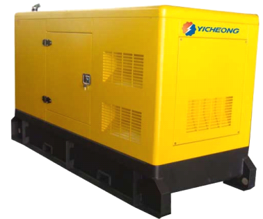
Super silent canopy

Shenzhen Yicheong Jichai Power Co., Limited