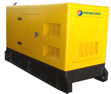
Super silent canopy

Shenzhen Yicheong Jichai Power Co., Limited Add: RunXun Industrial Park, HuanGuan Middle Rd., GuanLan, Bao'An Dist, Shenzhen, China Tel: 0086-755-27638427 Fax: 0086-755-27638460 Email: info@ycgenset.com