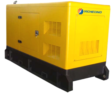
Super silent canopy

Shenzhen Yicheong Jichai Power Co., Limited