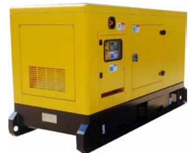
Super silent canopy

Shenzhen Yicheong Jichai Power Co., Limited Add: RunXun Industrial Park, HuanGuan Middle Rd., GuanLan, Bao'An Dist, Shenzhen, China Tel: 0086-755-27638427 Fax: 0086-755-27638460 Email: info@ycgenset.com