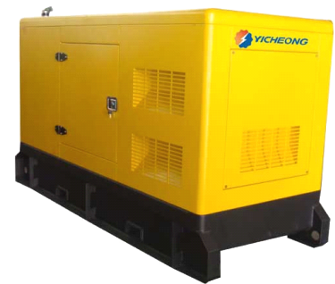
Super silent canopy

Shenzhen Yicheong Jichai Power Co., Limited