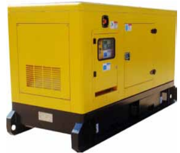
Super silent canopy

Shenzhen Yicheong Jichai Power Co., Limited Add: RunXun Industrial Park, HuanGuan Middle Rd., GuanLan, Bao'An Dist, Shenzhen, China Tel: 0086-755-27638427 Fax: 0086-755-27638460 Email: info@ycgenset.com