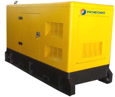
Super silent canopy

Shenzhen Yicheong Jichai Power Co., Limited Add: RunXun Industrial Park, HuanGuan Middle Rd., GuanLan, Bao'An Dist, Shenzhen, China Tel: 0086-755-27638427 Fax: 0086-755-27638460 Email: info@ycgenset.com