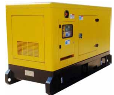
Super silent canopy

Shenzhen Yicheong Jichai Power Co., Limited Add: RunXun Industrial Park, HuanGuan Middle Rd., GuanLan, Bao'An Dist, Shenzhen, China Tel: 0086-755-27638427 Fax: 0086-755-27638460 Email: info@ycgenset.com