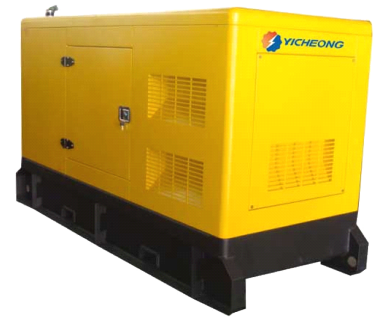
Super silent canopy

Shenzhen Yicheong Jichai Power Co., Limited Add: RunXun Industrial Park, HuanGuan Middle Rd., GuanLan, Bao'An Dist, Shenzhen, China Tel: 0086-755-27638427 Fax: 0086-755-27638460 Email: info@ycgenset.com