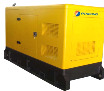
Super silent canopy

Shenzhen Yicheong Jichai Power Co., Limited