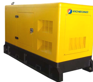
Super silent canopy

Shenzhen Yicheong Jichai Power Co., Limited