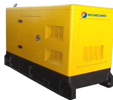
Super silent canopy

Shenzhen Yicheong Jichai Power Co., Limited Add: RunXun Industrial Park, HuanGuan Middle Rd., GuanLan, Bao'An Dist, Shenzhen, China Tel: 0086-755-27638427 Fax: 0086-755-27638460 Email: info@ycgenset.com